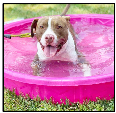
PawFest, a celebration of pets, is held in Mt. Vernon the second Saturday of June each year! Find more information at mtvfestivals.com!

107 Perkins Avenue 618-244-8024 https://jeffersoncounty.illinois.gov/ services/animal_control