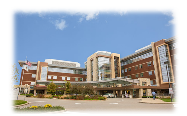
SSM Health Good Samaritan Hospital

411 N Water Tower Place Suite E 618-242-3516 patientcare.com